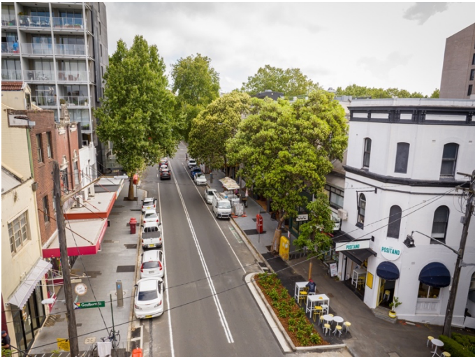
Above: completed works near Goulburn Street in November 2023.