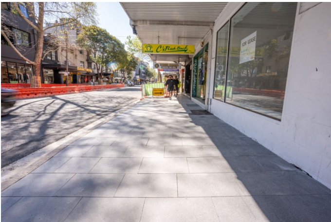
Above: completed footpath finish with paving completed near Campbell Street, August 2023.