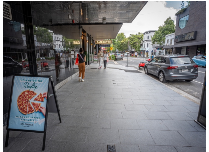
Above: completed works pictured outside Columbian Hotel in November 2023.