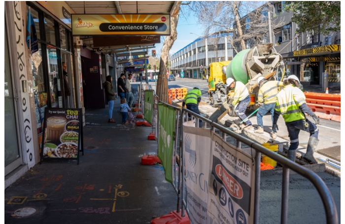
Above: construction work underway with footpath open for use near 300 Crown Street in August 2023.